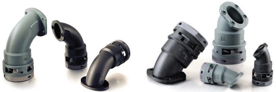
Flanschanschluss 90° flange connector 90°